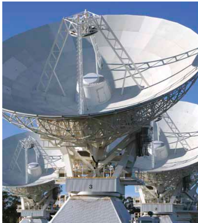
CSIRO's Australia Telescope Compact Array near Narrabri in NSW.

The longer wavelength of radio waves means radio telescopes need to be much larger than optical telescopes to generate high resolution images. Radio telescopes are some of the largest scientific instruments in the world.