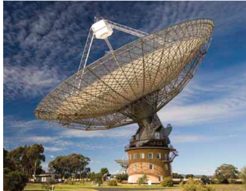
CSIRO’s Parkes radio telescope is also known as “The Dish”.