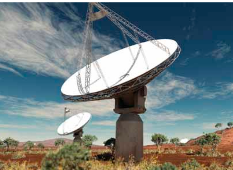
Artist’s impression of the Australian Square Kilometre Array Pathfinder (ASKAP) telescope, a new telescope being built by CSIRO in Western Australia. Credit: Swinburne Astronomy Productions. Design data provided by CSIRO.

Because they are so sensitive to radio emissions, radio telescopes are highly susceptible to interference from modern-day radio-communication services and emissions from other electrical equipment. To minimise such interference radio astronomy antennas are usually placed in remote locations where there is a low population density.