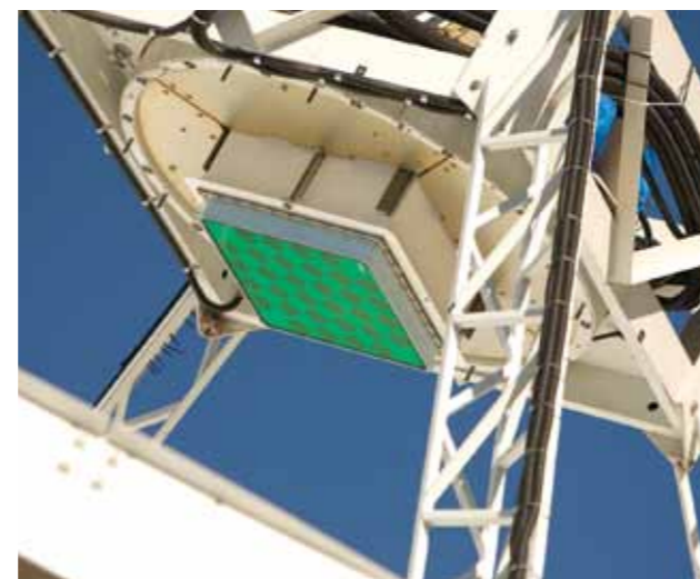
ASKAP's prototype phased array feed on the Parkes Testbed Facility.

Due to the challenge of integrating a whole new system at the remote ASKAP observatory, CSIRO commissioned Wild Sets, a film set company, to build a model dubbed 'SAPKAP' (so named because it is made of wood). SAPKAP, a full-scale model of the ASKAP pedestal, mount and hub, has enabled the ASKAP team to learn how to set up a working ASKAP antenna before heading out to remote Western Australia.