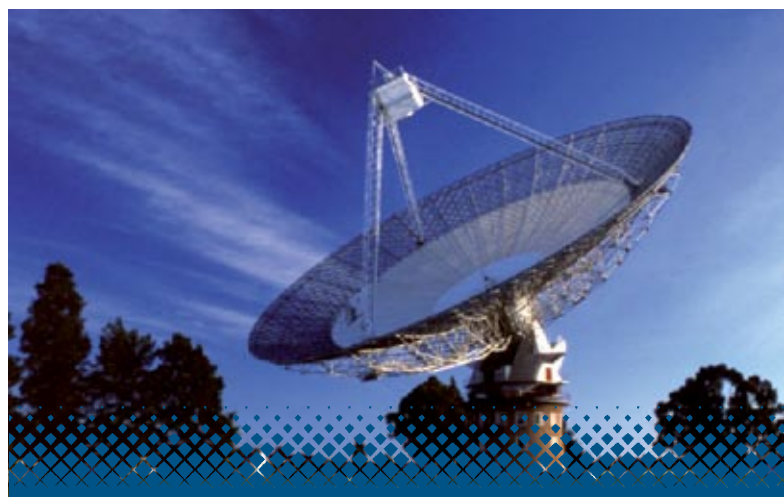
CSIRO Parkes radio telescope (aka 'The Dish'), NSW, Australia

Because they are so sensitive to radio emissions, radio telescopes are highly susceptible to interference from modern-day radio-communication services and emissions from other electrical equipment. To minimise such interference radio astronomy antennas are usually placed in remote locations where there is a low population density.