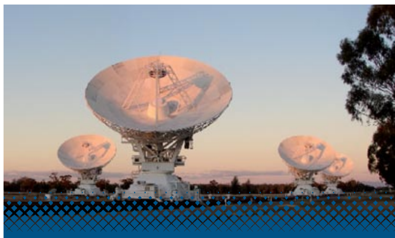
The CSIRO's Australia Telescope Compact Array (ATCA), Paul Wild Observatory near Narrabri NSW.